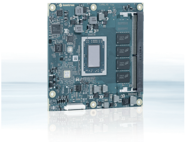
// COMe-cVR6 (E2)

With the launch of the AMD Ryzen<sup>™</sup> Embedded V1000, a new benchmark processor has hit the embedded market that is leading in all key categories of its class. Kontron offers the new processor also on COM Express<sup>®</sup> Compact, thus in a form factor that is much smaller and saves more space than most alternative offers.